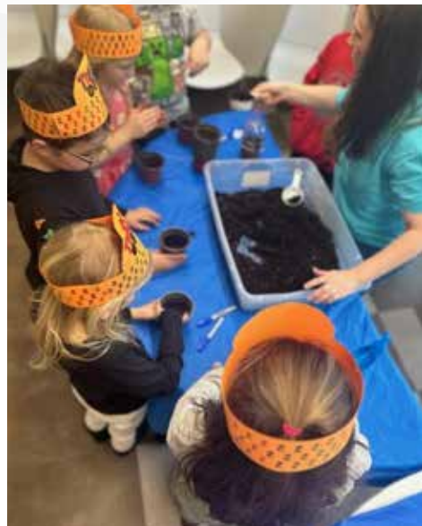
Village of Barboursville Elementary School students stopped by to learn about growing their own food.