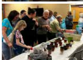
Herb gardening class with the WV Extension Office.